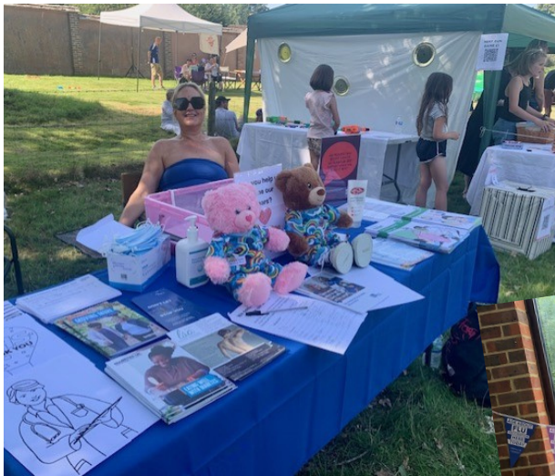
Old Basing Village Show (below)